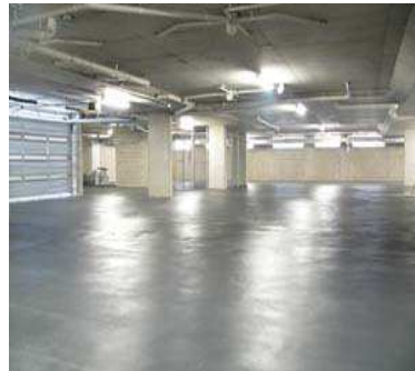
Top Picture: Concreshield X applied to pre stamped concrete driveway.