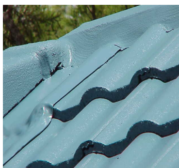
Top Picture: Roofbond Flexible Pointing.